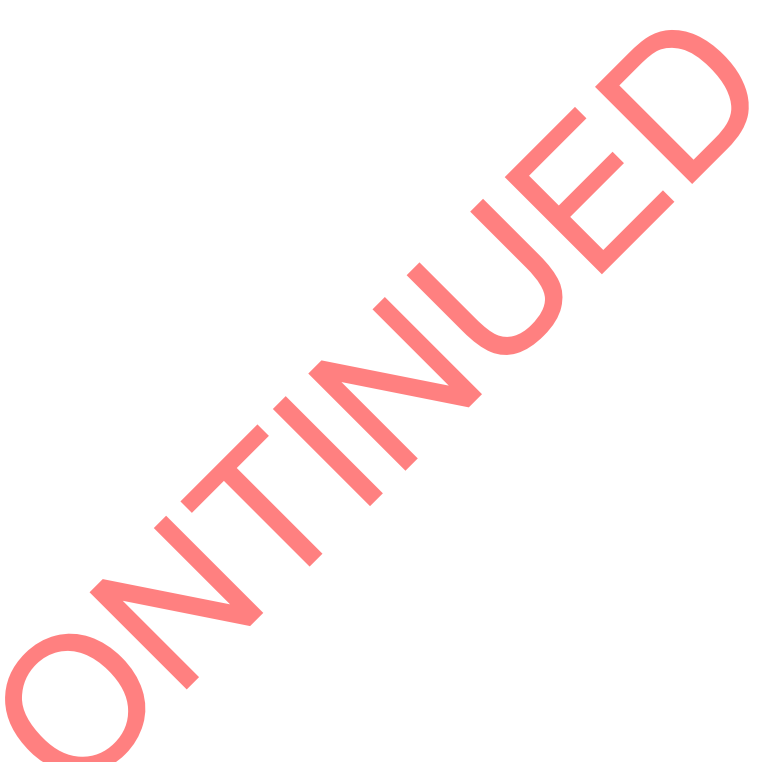
Copyright © 2013, 2017 Skyworks Solutions, Inc. All Rights Reserved.

Information in this document is provided in connection with Skyworks Solutions, Inc. ("Skyworks") products or services. These materials, including the information contained herein, are provided by Skyworks as a service to its customers and may be used for informational purposes only by the customer. Skyworks assumes no responsibility for errors or omissions in these materials or the information contained herein. Skyworks may change its documentation, products, services, specifications or product descriptions at any time, without notice. Skyworks makes no commitment to update the materials or information and shall have no responsibility whatsoever for conflicts, incompatibilities, or other difficulties arising from any future changes.