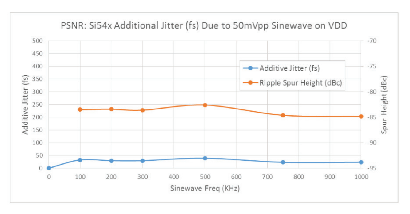
Figure 4. Integrated PSNR Minimizes Additive Jitter

The 4th generation DSPLL has an extensive network of on-chip low drop out regulators to provide power supply noise rejection, ensuring consistently low jitter operation even in noisy system environments. Another benefit of integrated power supply noise regulation is simplified power supply filtering, PCB design and layout.